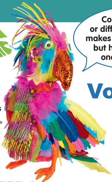
Scribbles Your Colorations® Friend

Collecting pictures or different art materials makes a beautiful collage, but have you ever had one you can read?